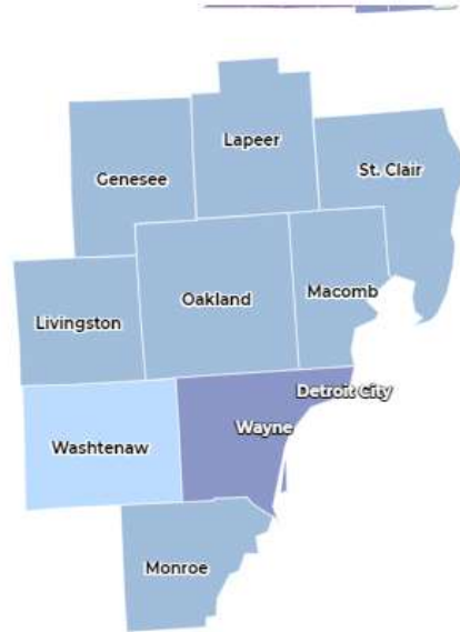
County risk levels calculated from July 2, 2021 data, explanation