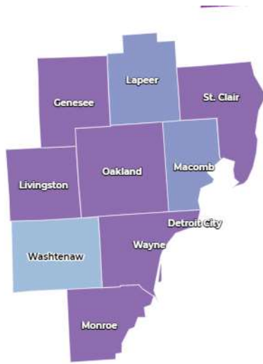
County risk levels calculated from June 11, 2021 data, explanation