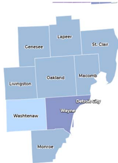
County risk levels calculated from July 2, 2021 data, explanation