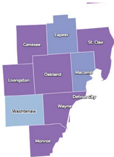
County risk levels calculated from June 11, 2021 data, explanation